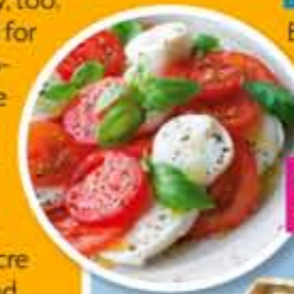
Feast on homemade buffalo mozzarella after visiting the ancient city

or half-board basis and, given the delicious local food and drink on offer, why would you not want to dine in? BOOK IT Long Travel has seven nights' B&B at Tenuta Seliano from £504pp, including flights from London and car hire (01694 722 193; www.long-travel.co.uk ).