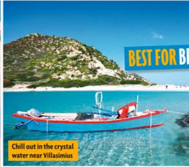
Chill out in the crystal water near Villasimius