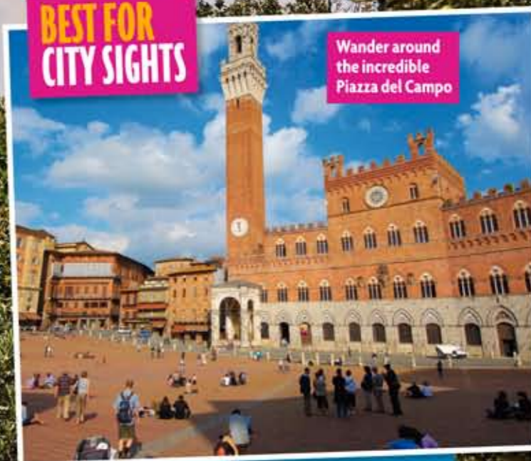
Wander around the incredible Piazza del Campo